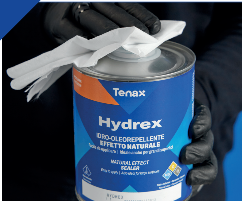
Dampen the cloth