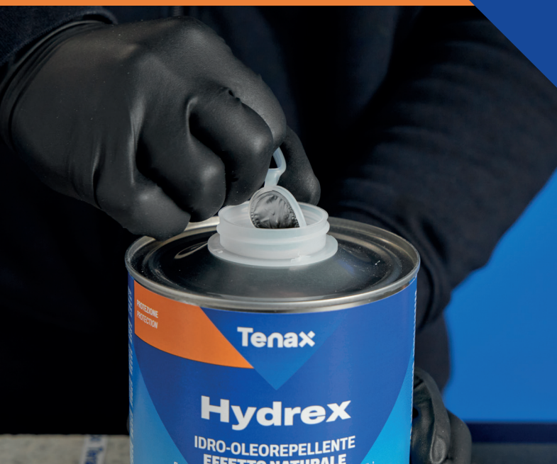
Opening the can