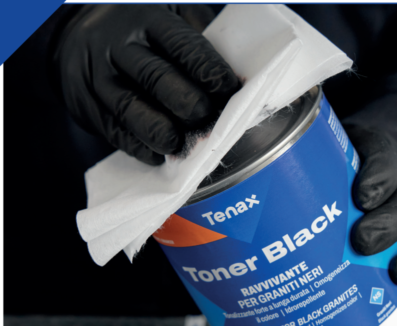
Dampen the cloth