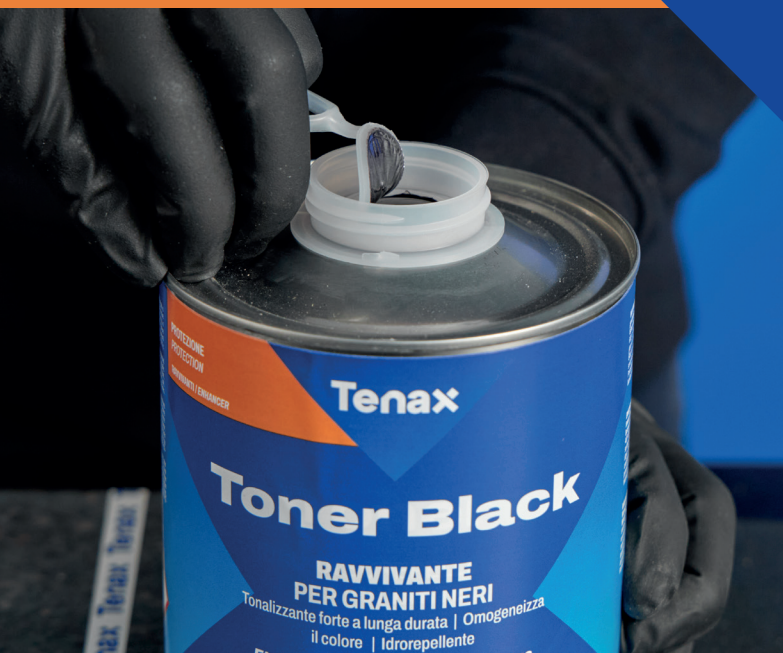
Opening the can