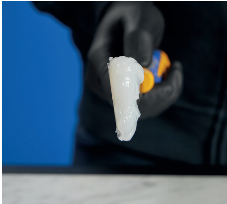
Post mix verticality