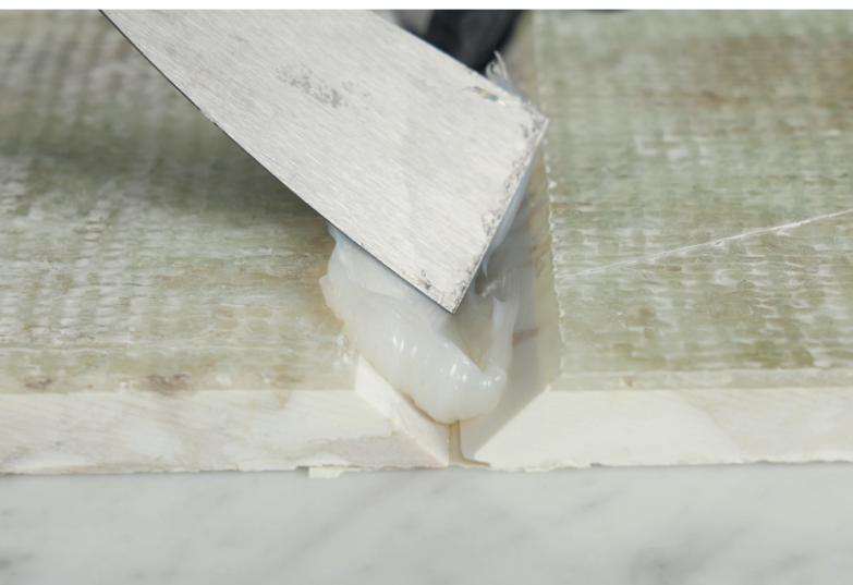
Mixed product appearance