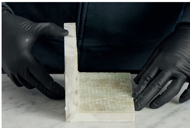
Hardened product appearance