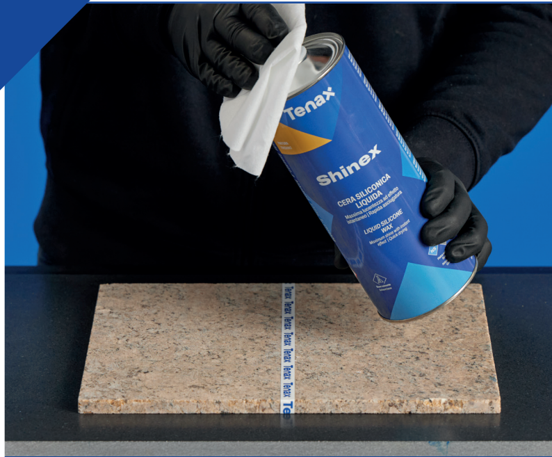
Dampen the cloth