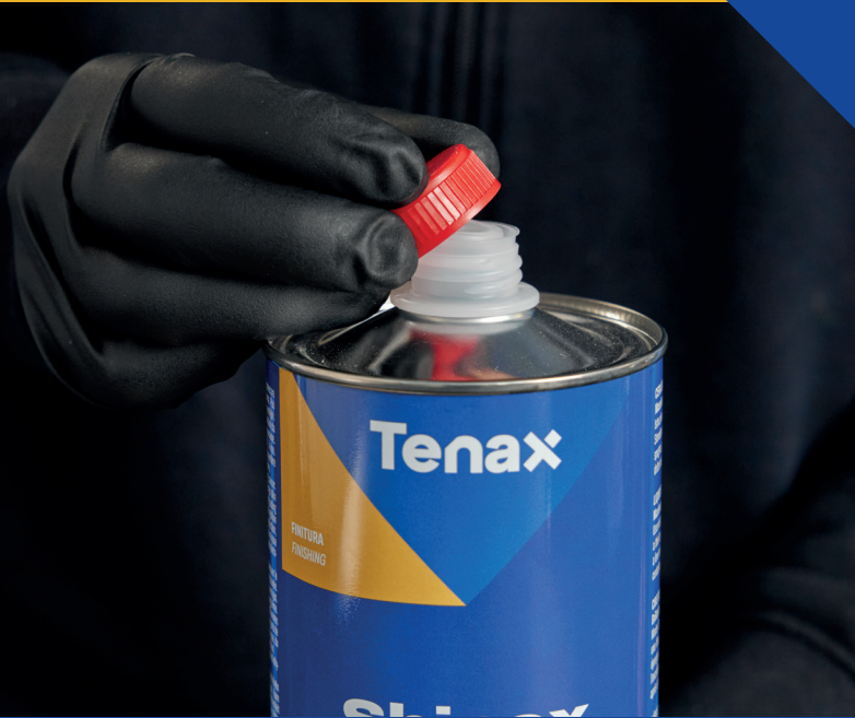
Opening the can