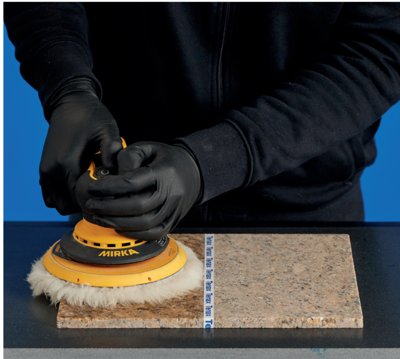
For a higher gloss, use the flex with a wool cloth