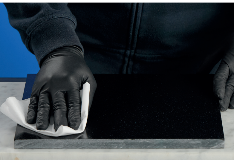
Rinse with water