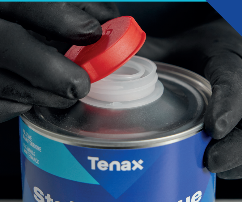
Opening the can