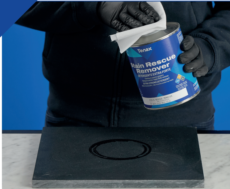
Dampen the cloth