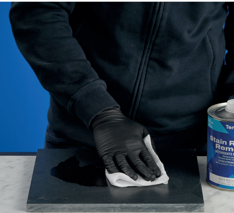
Apply the product to the surface