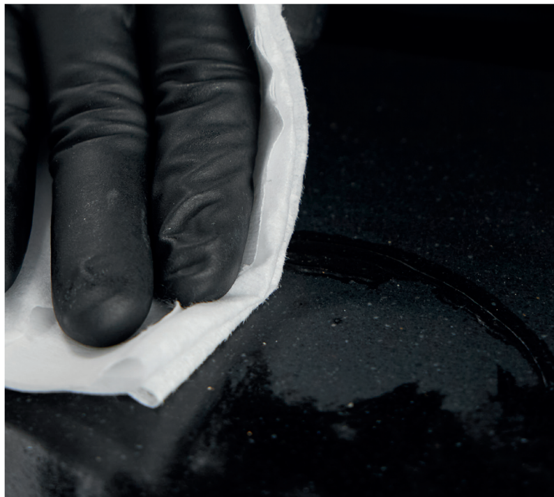
Assess cleaning of layered grease stains