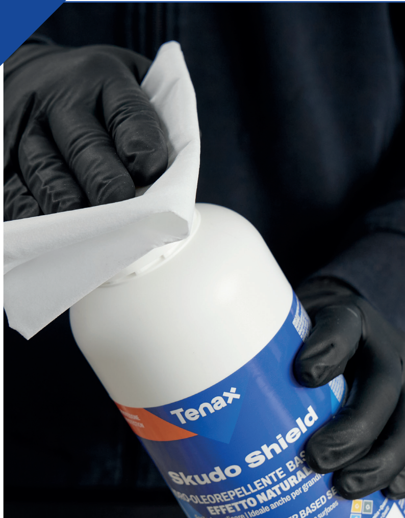
Dampen the cloth