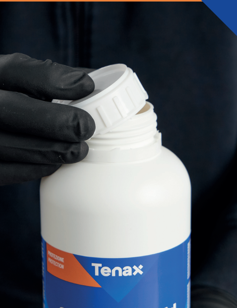
Opening the can