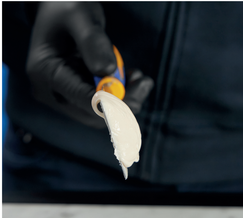
Post mix verticality