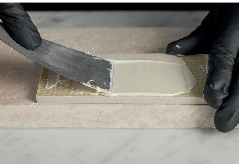
Mixed product appearance